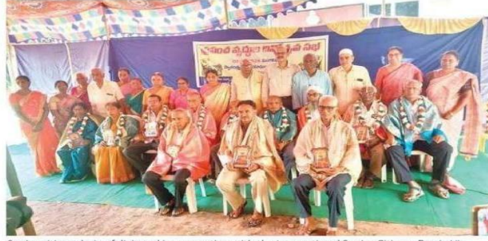
Senior citizens being felicitated in connection with the International Senior Citizens Day in Vijayawada on Tuesday

The government organises programmes for women, children, differently-abled and even workers day celebrations with government funds. But there is nothing like that with senior citizens.