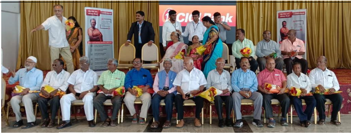
Felicitation to senior citizens under the supervision of ICICI Bank.