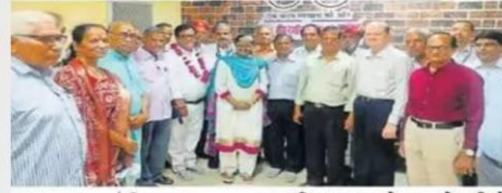
भास्कर न्यूज़ | भीलवाड़ा