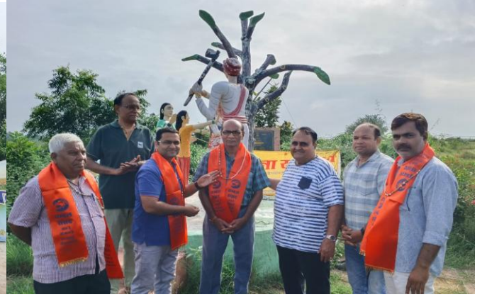
अमृता देवी विश्नोई बलिदान दिवसः