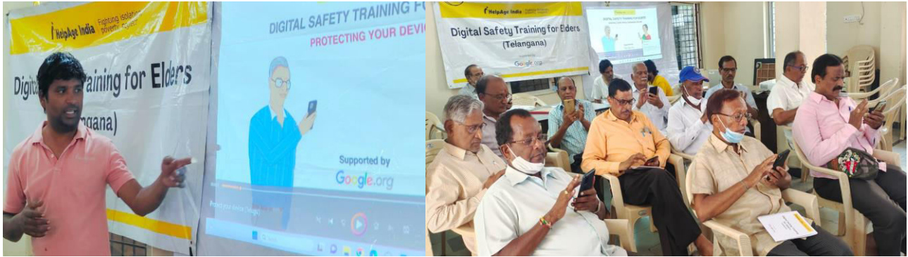
In New Maruthinagar Senior Citizens Association