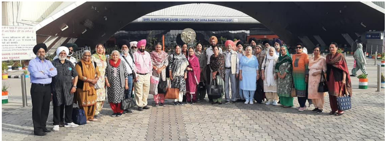
MSCA: 48 members from Mohali Senior Citizens Association visited Kartarpur Sahib in Pakistan on 28 th March 2023.