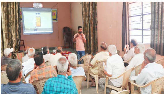
At the Sachivalaya Nagar Senior Citizens Welfare Association with 25 elders.