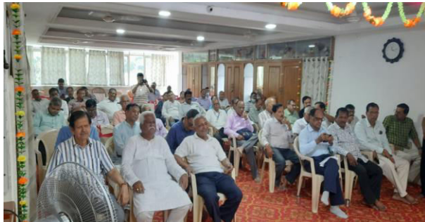
A seminar was organised for leaders of different senior citizens associations of Odisha on 18 th April