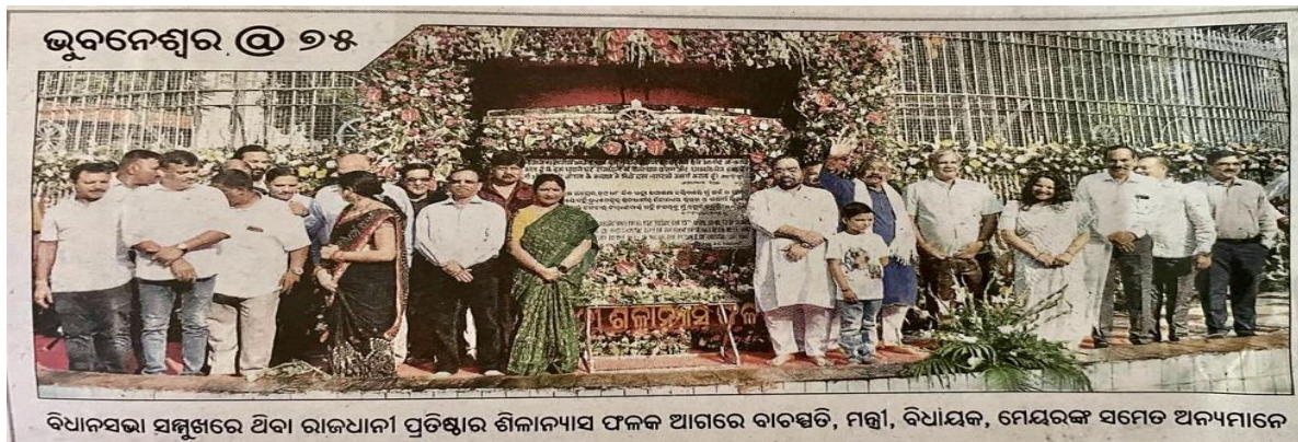
ବିଧାନସଭା ସମ୍ମୁଖରେ ଥିବା ରାଜଧାନୀ ପ୍ରତିଷ୍ଠାର ଶିଳାନ୍ୟାସ ପଳକ ଆଗରେ ବାଚସ୍ପତି, ମନ୍ତ୍ରୀ, ବିଧାୟକ, ମେମ୍ବରଙ୍କ ସମେତ ଅନ୍ୟମାନେ

ରାଜଧାନୀ ପ୍ରତିଷ୍ଠା ଦିବସ ରେ ହିଁ ଏଇ ପଥର ତି ମନେପଡେ। ଲକ୍ଷ ଲକ୍ଷ ଲୋକେ ସେଇ କଡରେ ନିଇତି ଯିବା ଆସିବା କରୁଥିଲେ ବି କାହାରି ନଜର ରେ ଏ ପଥର ଖଣ୍ଡିକ ଆସେନି। ଆଜିର ବେଶଭୂଷା ରେ ସୁନ୍ଦରୀ ସାଜିଥିବା ପଥର ତିକୁ ସବୁଦିନିଆ ବୋହୂଟିଏ ଭଳି ସଜାଇ ରଖିବାରେ କଣ ଉତ୍କର୍ଷ କଳା ର କ୍ଷେତ୍ରରେ କଳାକାରଙ୍କ ଅଭାବ.