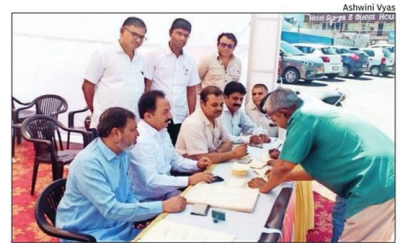
Citizens participate in the postcard campaign in Jodhpur on Saturday