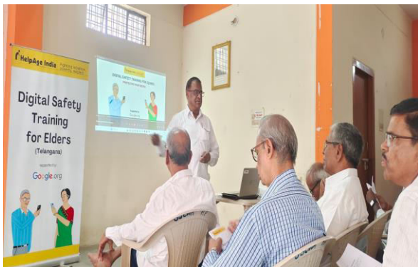
Hayat Nagar Central Senior Citizens Welfare Association in cooperation with Google in Hyderabad