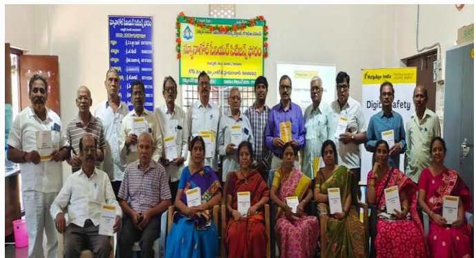
A workshop for 28 at New Nagol Senior Citizens Welfare Association .