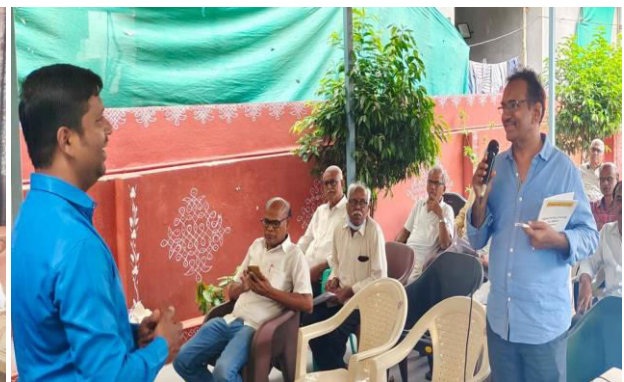
Bhavani Nagar Senior Citizens Welfare Association with 35 elders