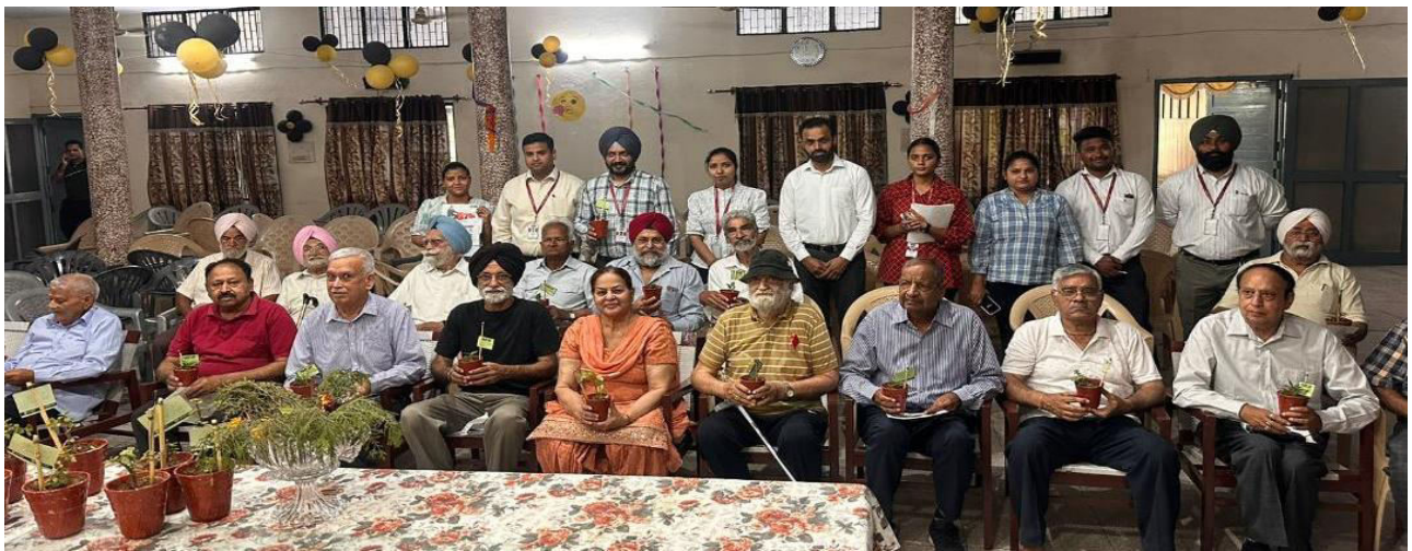
Senior Citizens Welfare Association Patiala celebrating Earth Day, where the IDFC bank officials distributed plants to the members.