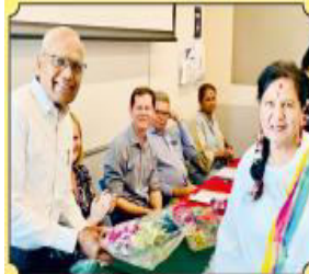
P. Narsimha Rao, Speaking in Indian Sc. Citizens meeting in Melbourne, Australia