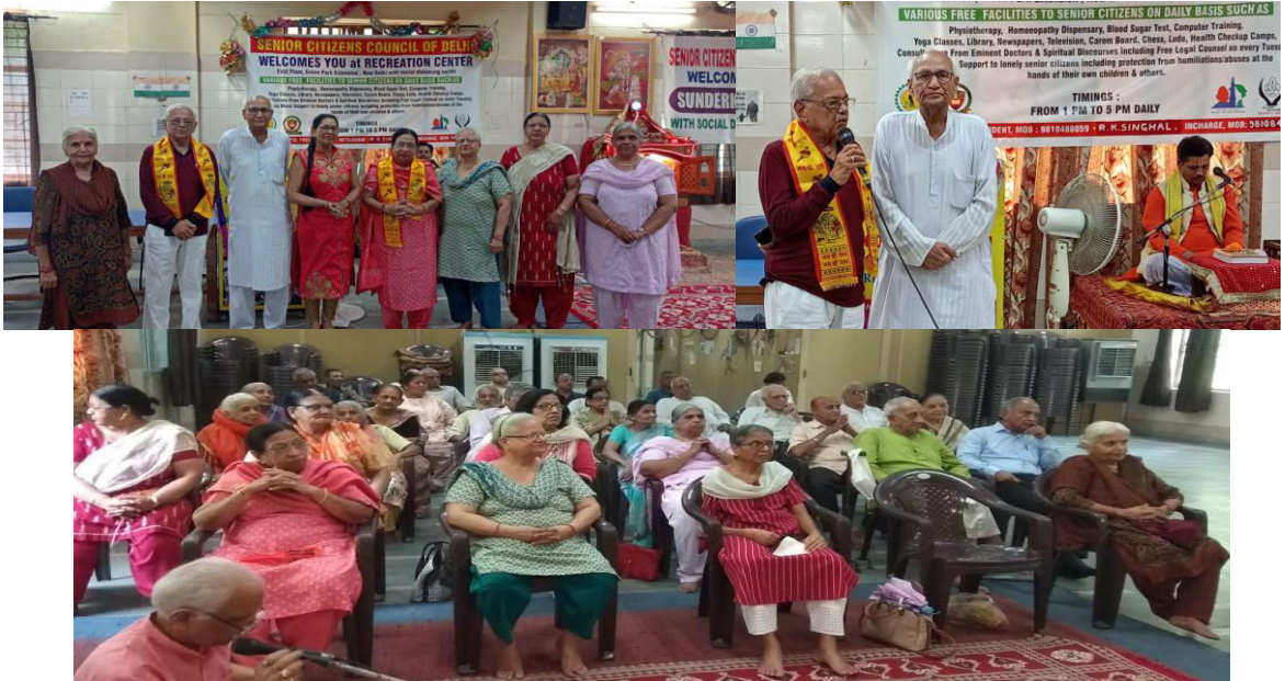
The Recreation Centre of Senior Citizens Council of Delhi at Community Centre, Green Park Extension.