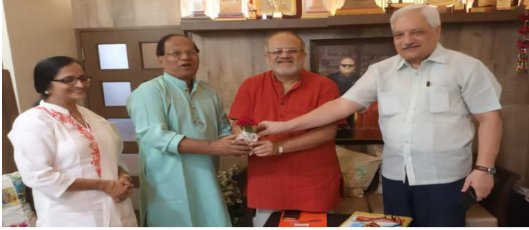
समस्त फेस्कॉम परिवार व रोडे परिवार यांचे कडुन हार्दिक शुभेच्छा