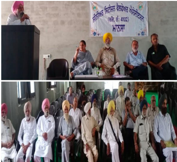
SCC Mansa monthly EC Meeting.