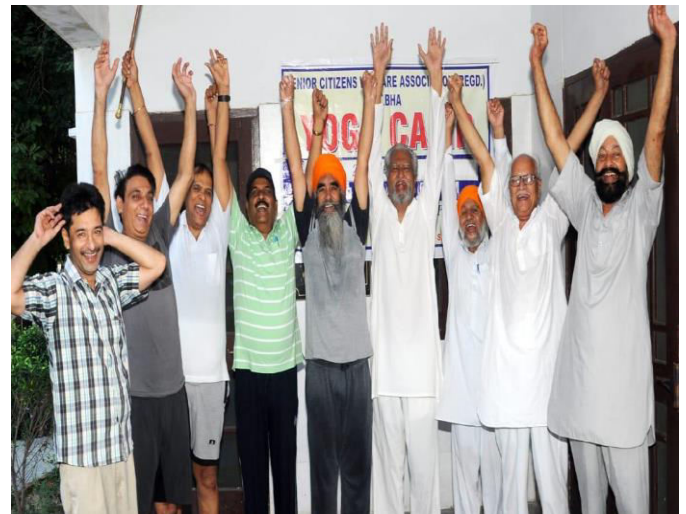
SCWA Nabha Yoga Camp