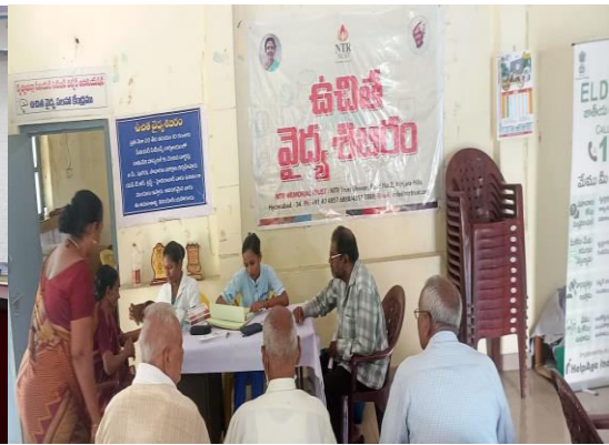
A Medical Camp