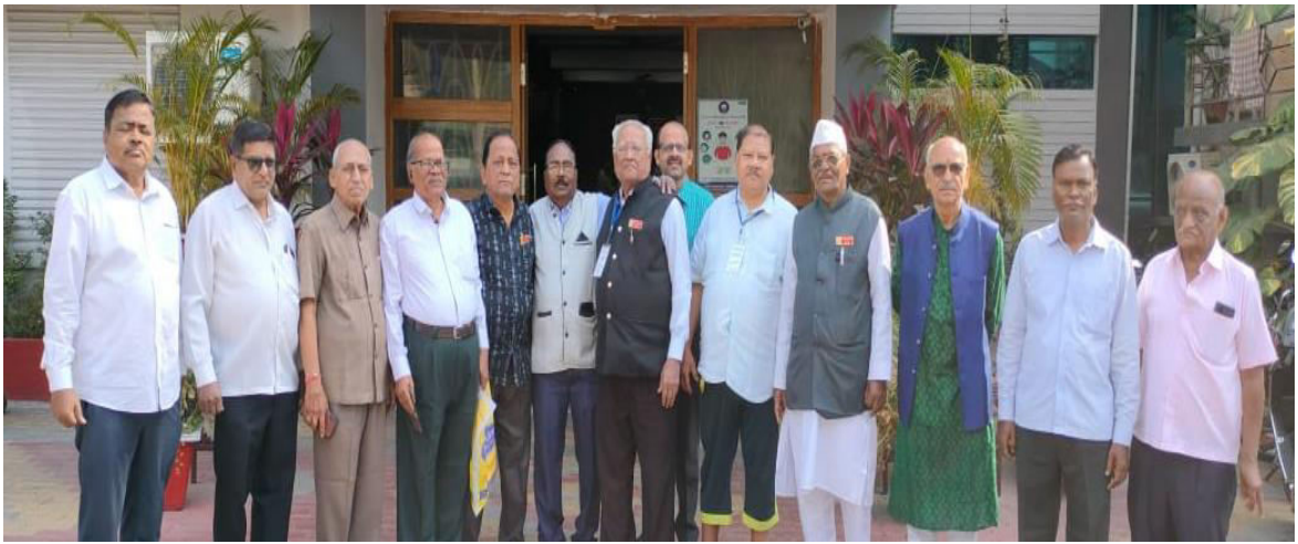
The office bearers of AISCCON at Panthaniwas, Sambalpur