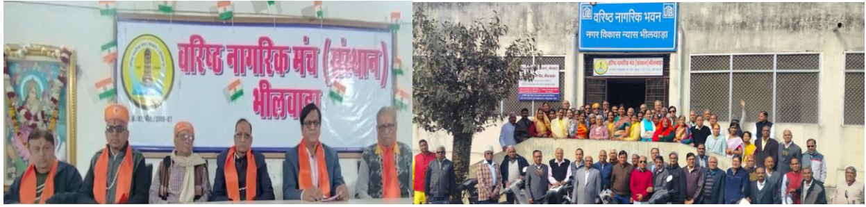
2. वरिष्ठ नागरिक मंच भीलवाड़ा द्वारा ध्वजारोहण एवम बसंत पंचमी