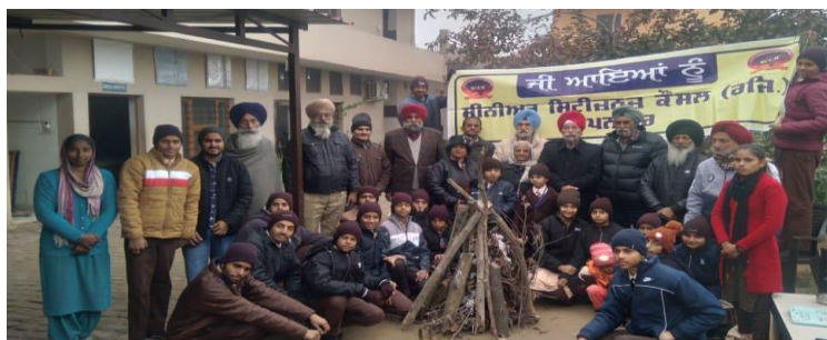
Lohri festival with special-needy students of Badir Vidialia village Shampura in Rupnagar.