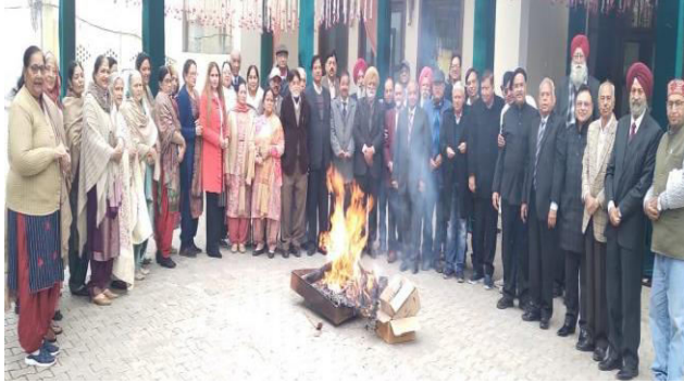
Lohri by SCA, Sirhind.