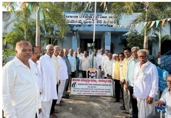
Flag hoisting in Day Care Center in Mancheriala