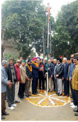
Republic Day by SCWC, Khanna.