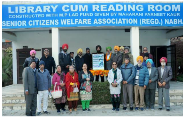
New year calendar from SCA, Nabha