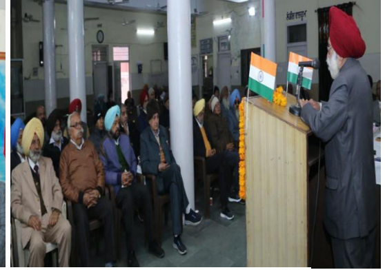
Republic Day by SCC, Rajpura