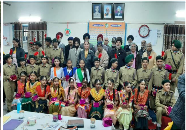
Republic Day and Basant Panchami by adopted school students in campus of SCWA, Patiala.