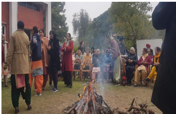
Lohri by members of Mohali SCA