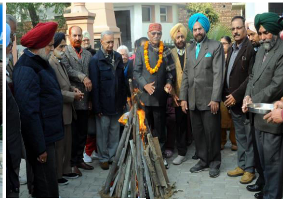
Lohri by SCA, Nabha