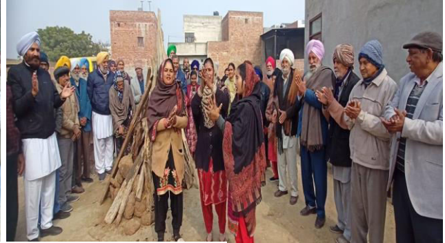
Lohri by SCA, Mansa