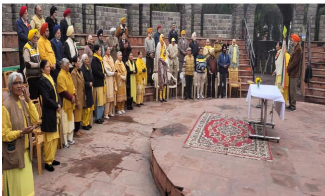
LAF Centre, Sector-68 Mohali