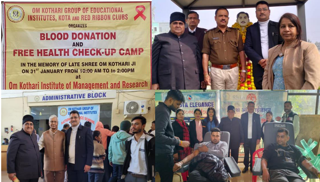
ओम कोठारी इंस्टीट्यूट ऑफ मैनेजमेंट एंड रिसर्च कॉलेज में स्वर्गीय ओम कोठारी की 50 वी जयंती.