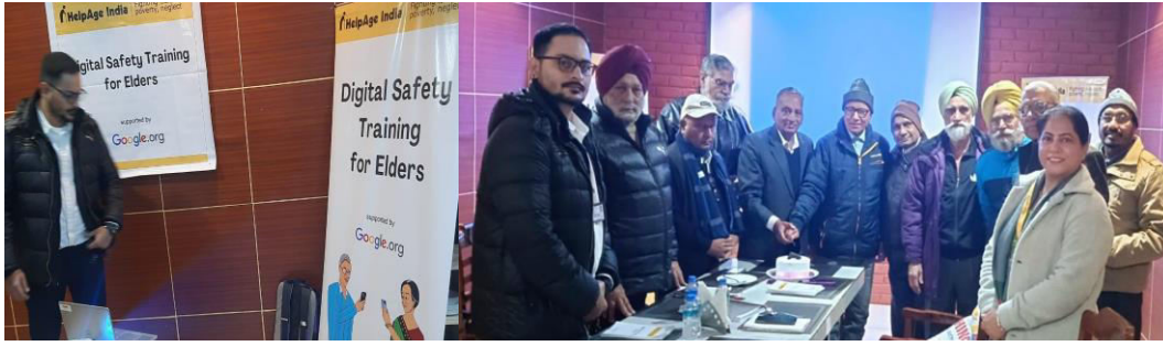
SCC, Bassi Pathana: In collaboration with Helpage India, a Digital Frauds camp on 8 th Jan.