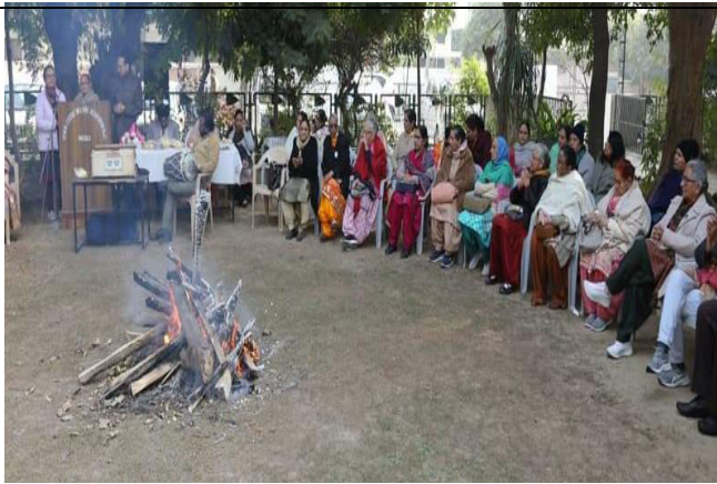
Lohri by SCWA, Patiala