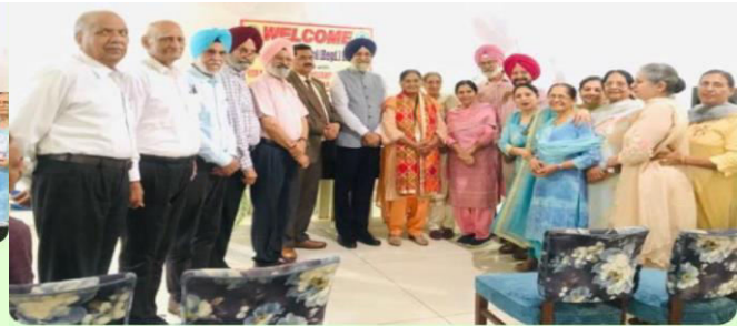
Council members enjoying the award announcement by AISCCON