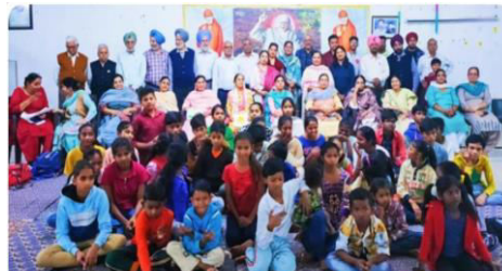
Council members with Rabta Students to celebrate Children day