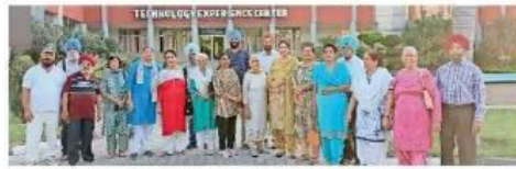
भारतक न्यूज़ | रोपड़