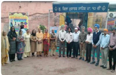
Council Members reciting Gurbani Shabad in Gurudwara Sahib Qila Mubarak